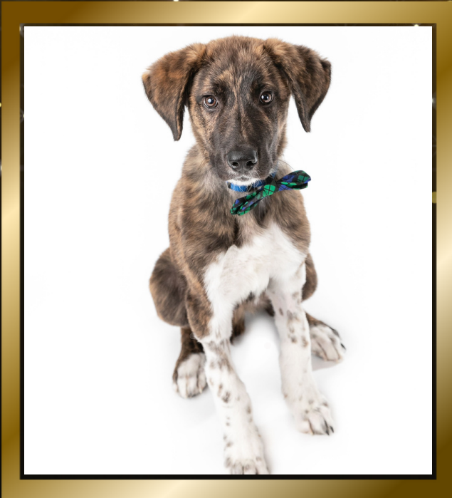
TABLE SPONSOR $2,000